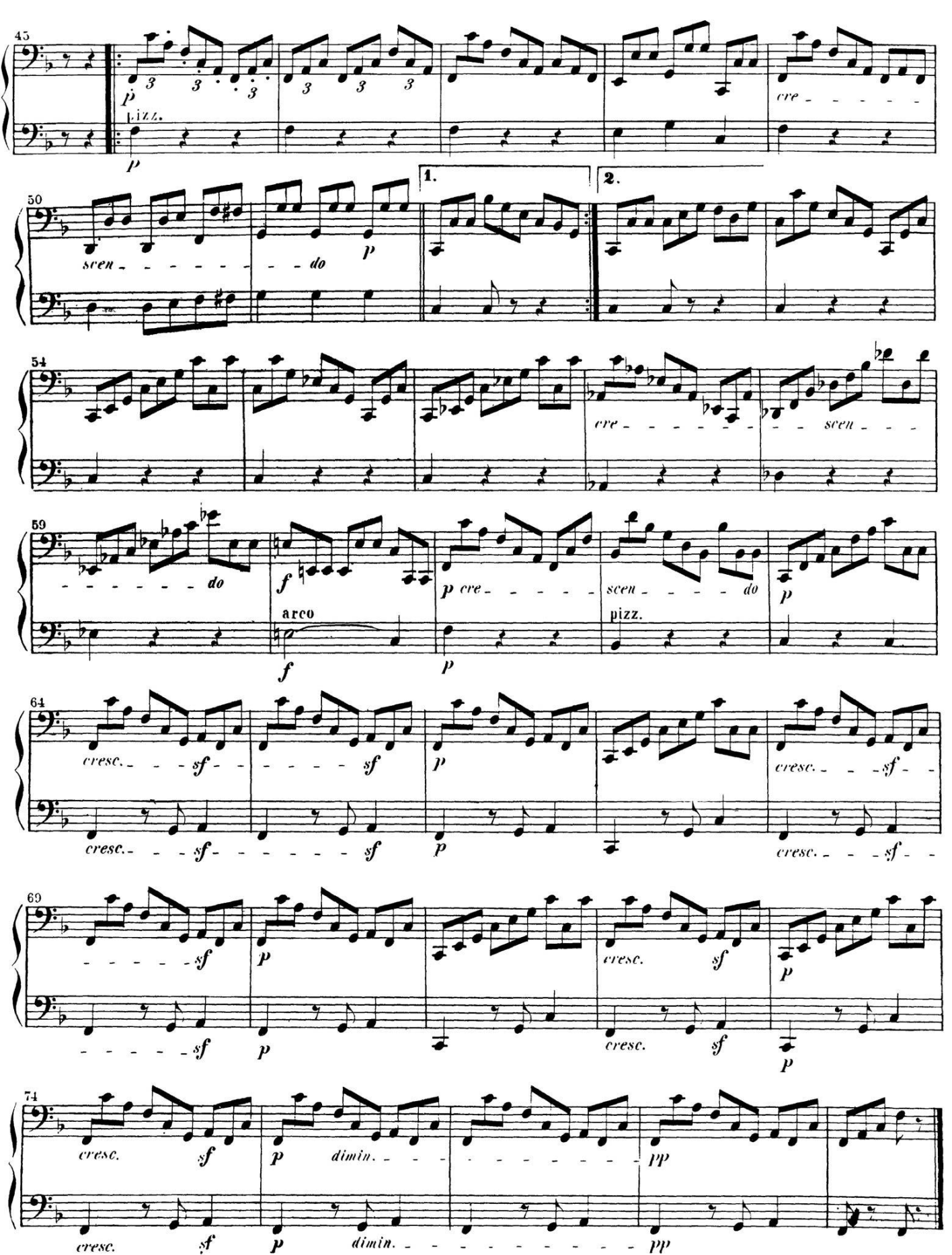
Menuetto da capo al Fine